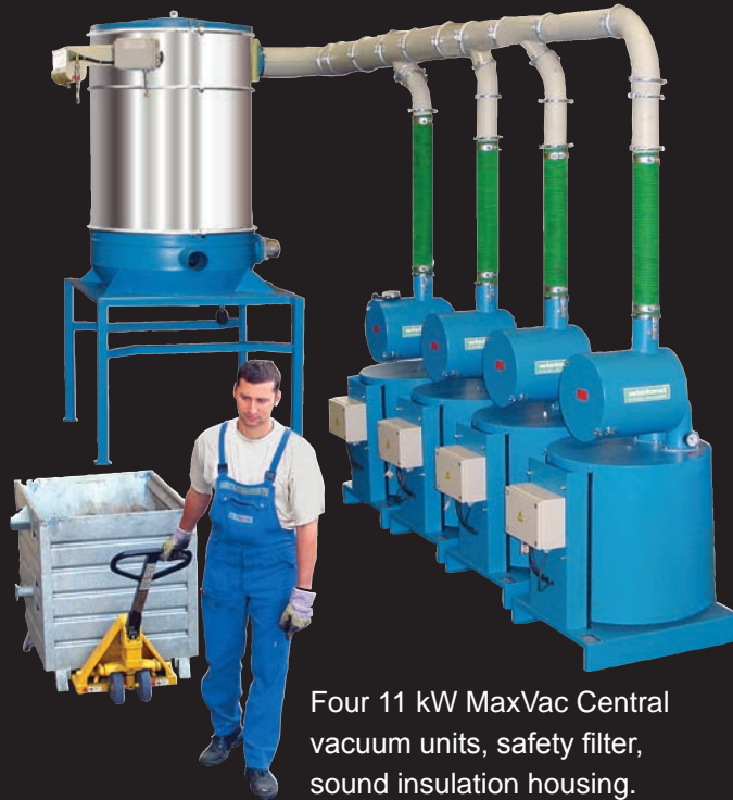
Four 11 kW MaxVac Central vacuum units, safety filter, sound insulation housing.