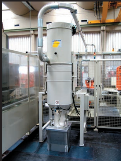
At maximum filling level the TowerVac discharges into an underfloor conveyor. The suction hose is connected to a pipe work system.