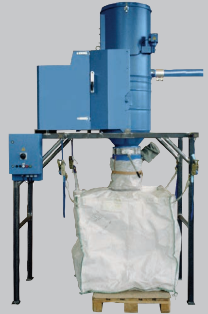
Discharge into BigBags. The suction material is packed ready for transport.