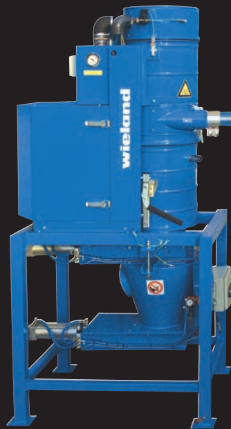
Discharge by double slide gate. Continuous or discontinuous discharge of the suction material.