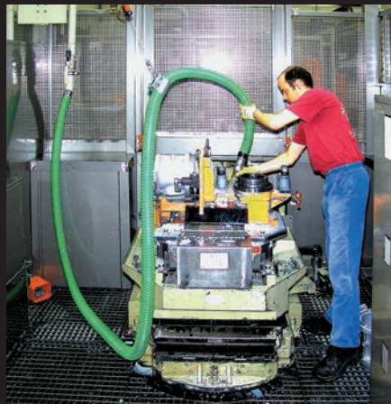
Cleaning of production machines in the metal working industry. Extraction of swarf and coolant.

A pipe work system makes suction power available at the work place.